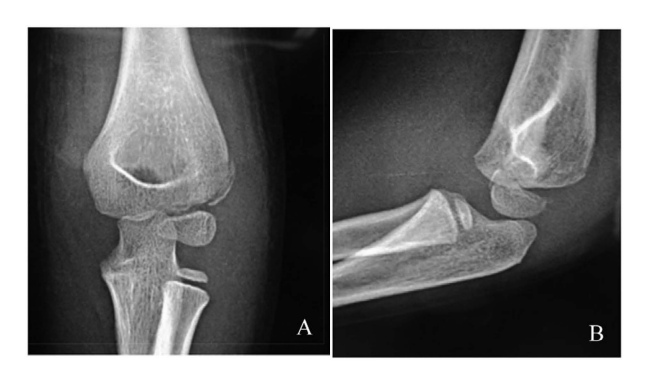
Fig 1(A) Xray elbow joint showing minimally displaced lateral condyle fracture and

Fig 1(B) internal oblique view of elbow showing reduction of fracture after traction and compression at fracture site