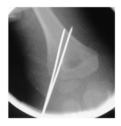
Fig 4 AP view of elbow joint showing percutaneous fixation of elbow joint with two K wires.