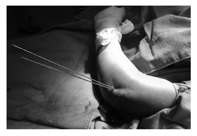
Fig 2 Showing percutaneous fixation of lateral condyle with two K wires.

Fig 1(B) internal oblique view of elbow showing reduction of fracture after traction and compression at fracture site